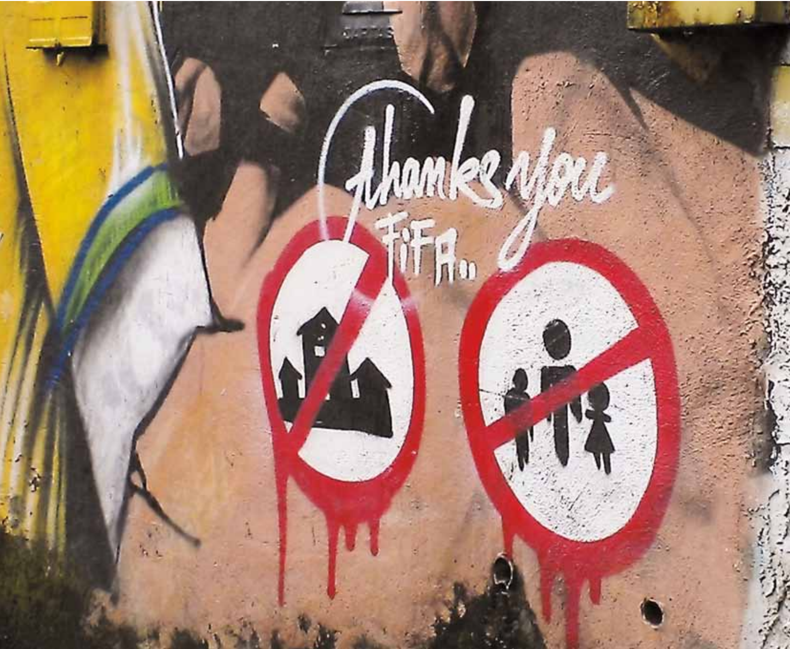
↑ Protest wall painting in the north Rio favela of Metro-Mangureira

never or rarely cover, the big media groups are beginning to fund and sponsor projects," she said. "It's a sign that our efforts to describe a different aspect of these neighbourhoods are starting to bear fruit.